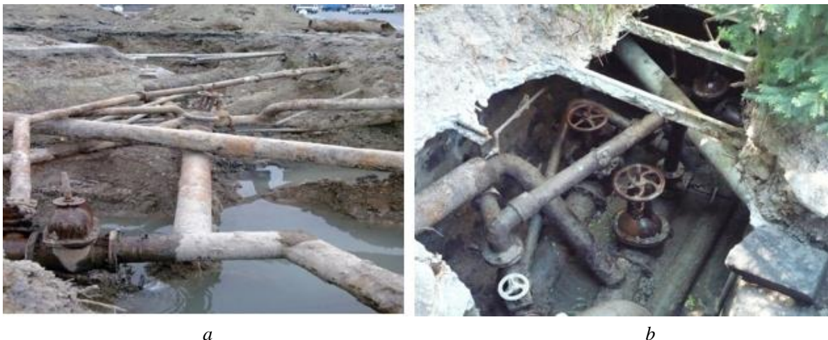
Fig. 3. Water supply network management units before reconstruction: a) network; b) chamber Рис. 3. Узел управления сетью водоснабжения до реконструкции: а) сеть; б) камера

A problem of pressure management in the water supply area is the decommissioning of local pumping stations. Because of the construction activities, 13 out of 22 pumping stations in the reconstruction zone were disabled. The remaining pumps were replaced with contemporary, reliable, high-efficiency pumps (Table 3).